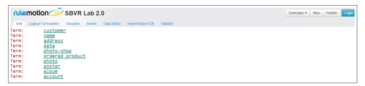
Figure 2: Terms in the Online Photo Shop case study

relational database design [8]. Hence, nouns are candidate terms and verbs connecting these nouns together are candidate (binary) fact types. Using this as a rule of thumb, the following Terms (Figure 2) and Fact Types (Figure 3) have been extracted for the Online Photo Shop (Section 3.1).